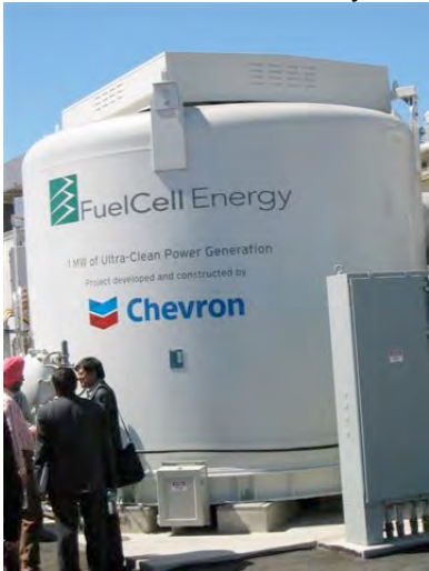
Fig. 2. The 1 MW Fuel Cell at Santa Rita Jail The fuel cell at the jail was intended to provide a consistent base load of 1 MW. The fuel cell’s performance has not been good. In fact, it produced at a 100% capacity factor in only one month over the 2007-2009 period. The missed 2009 bill savings resulting from less-than-perfect performance are shown in Figure 3.

from the PV system, with the exception of a single month in 2007, has not exceeded 700 kW in recent years.