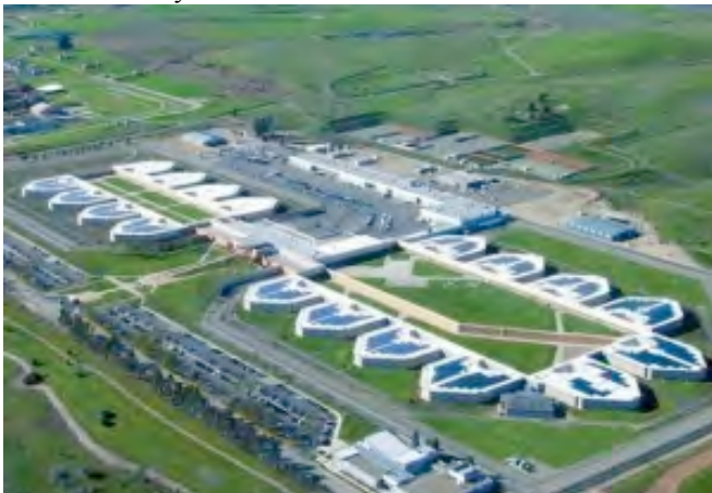
Fig. 1. Jail Aerial View

A large microgrid project is nearing completion at Alameda County's twenty-two-year-old 45 ha 4,000-inmate Santa Rita Jail, about 70 km east of San Francisco. Often described as a green prison , it has a considerable installed base of distributed energy resources (DER) including an eight-year old 1.2 MW PV array, a five-year old 1 MW fuel cell with heat recovery, and considerable efficiency investments. Fig. 1 is an aerial depiction of the Jail with the PV rooftop modules clearly visible.